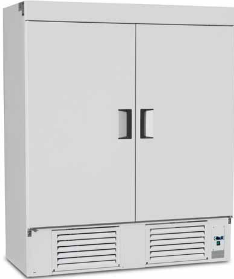
I-Ola P M Gastro*